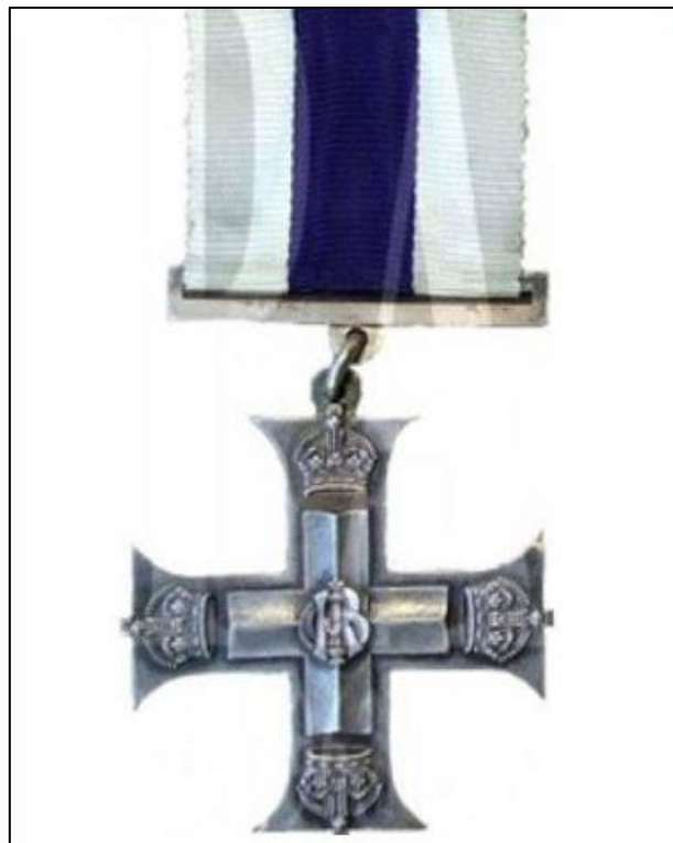
A Military Cross