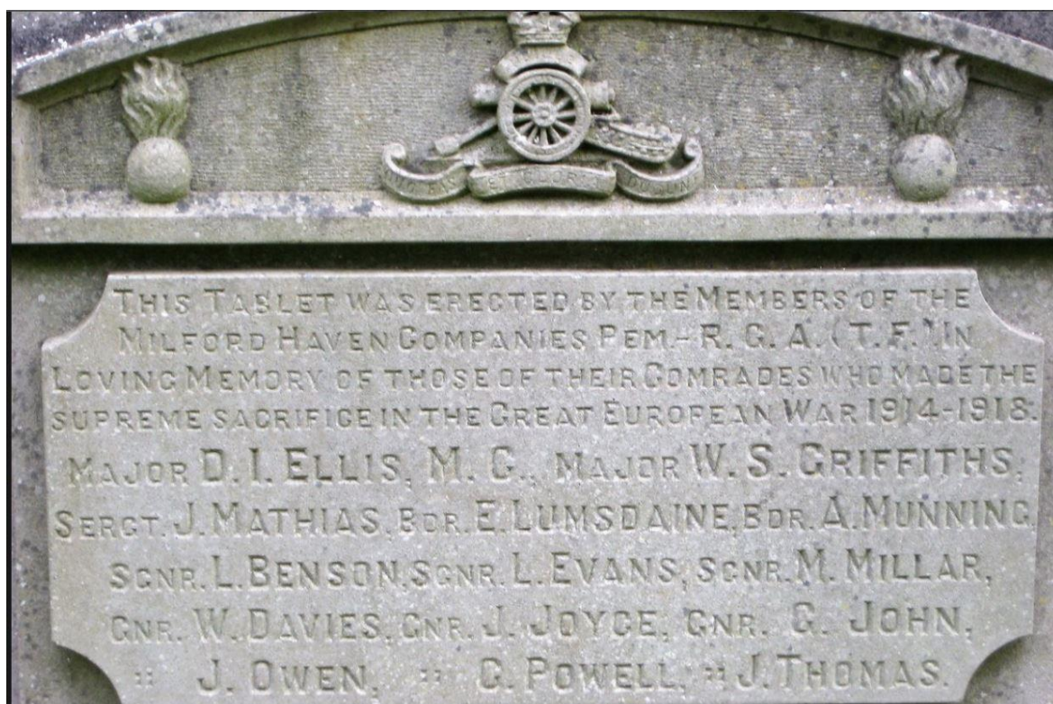
Major David Ithel Ellis Memorial Stone at Milford Haven